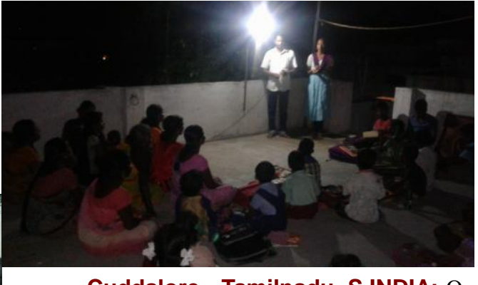
Cuddalore - Tamilnadu, S.INDIA: On November 14 every year, Children's Day is celebrated all across India. The day emphasizes on the importance of giving love, attention and affection to children. On this day, many educational and motivational programs are held across India, by and for children. Florance Home Foundation (FHF) celebrated the day

organizing different events in its centre in Killai . More than 40 children took part in the events with Board and staff team of FHF, who shared their thoughts on various rights of children keeping education on top priority along with empowering girl child. The day was celebrated with games, and distribution of food, gifts and education materials. Children also performed cultural programs emphasizing on child rights and the importance of education.