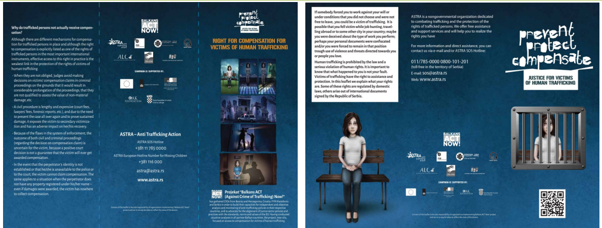
„Prevent, Protect, Compensate – Justice for Victims of Trafficking in Human Beings“ – IFS-EMMAUS campaign

Countries of origin, as well as countries of transit and destination, are encouraged to reinforce their efforts to prevent and combat irregular migration by improving their domestic laws and measures, and by promoting educational and information activities for those purpose. Policies that may encourage people to resort to irregular migration should be reviewed and modified.